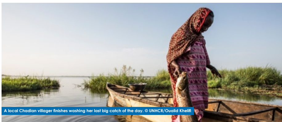
A local Chadian villager finishes washing her last big catch of the day.