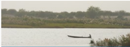
Baga-Sola (Lake Chad) Few fishermen dare venture on the waters of the Lake since the beginning of the Nigerian crisis.

As part of his joint visit in Chad with President Buyoya, Head of the African Union Mission for Mali and the Sahel (MISAHEL)... Read more P.4