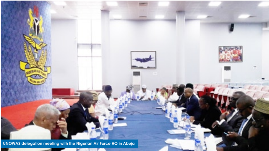
UNOWAS delegation meeting with the Nigerian Air Force HQ in Abuja

Since 2009, when the erstwhile leader of Boko Haram Mohammed Yusuf died in police custody, the level of killings and destruction, enslavement of girls and women, and the loss of livelihoods inflicted by the group has caught the world's attention. In response, the United Nations has adopted an approach that attempts to bring together the organization's vast experience, organizational capacity, and political leverage to address the multi-faceted challenges in a remote terrain stretching across national boundaries and touching upon sensitive interests. Secretary-General Ban Ki Moon himself has twice visited the region, to drum up and coordinate support for the affected populations in Nigeria and neighboring countries.