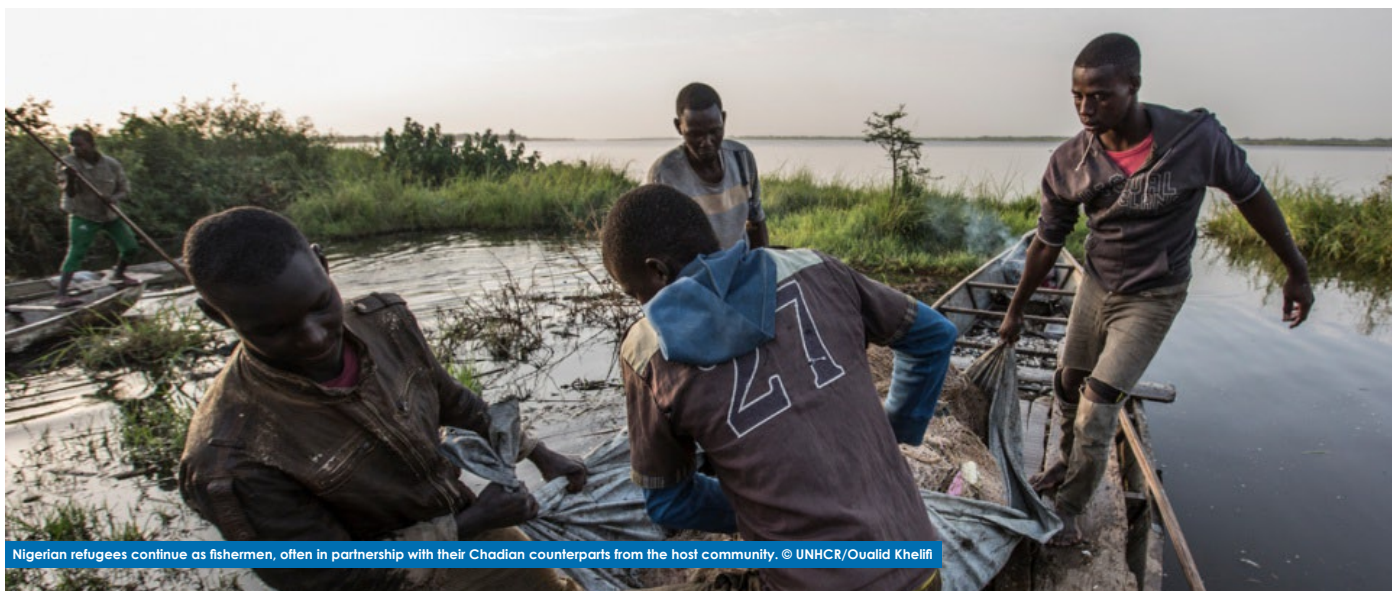
Nigerian refugees continue as fishermen, often in partnership with their Chadian counterparts from the host community.

More funding is needed so that more fishermen, farmers, herders and traders from the refugee and local communities can be included.