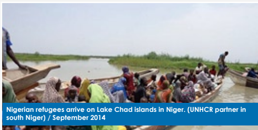
Nigerian refugees arrive on Lake Chad islands in Niger. September 2014

West Africa and the Sahel regions figured prominently in the discussions during the 71 st session of the General Assembly, which opened on 19 September 2016.. Read more P.5