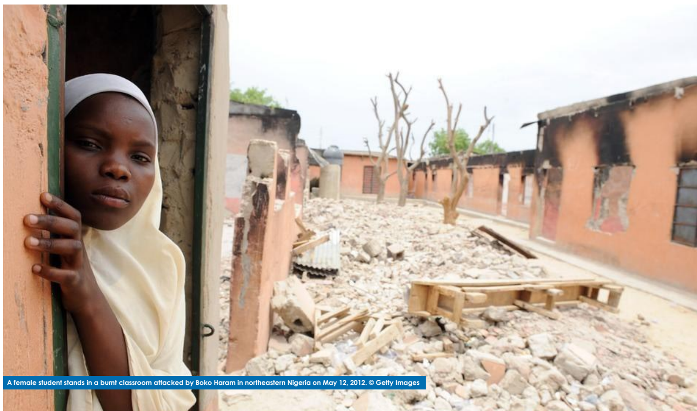
A female student stands in a burnt classroom attacked by Boko Haram in northeastern Nigeria on May 12, 2012.

The fight against terrorism is necessary, but the respect of human rights principles must be a permanent exigency for States as they are also guarantors of their citizens' freedoms.