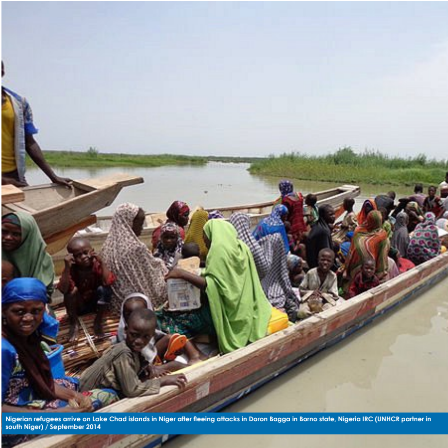
Nigerian refugees arrive on Lake Chad islands in Niger after fleeing attacks in Doron Bagga in Borno state, Nigeria IRC (UNHCR partner in south Niger) / September 2014

West Africa and the Sahel regions figured prominently in the discussions during the 71 st session of the General Assembly, which opened on 19 September 2016 at the United Nations headquarters.