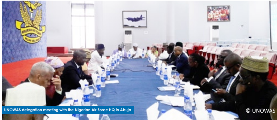
UNOWAS delegation meeting with the Nigerian Air Force HQ in Abuja

Since 2009, when the erstwhile leader of Boko Haram Mohammed Yusuf died in police custody, the level of killings and destruction, enslavement of girls and women, and the loss of livelihoods inflicted by the group has caught the world’s attention. In response, the United Nations has adopted an approach that attempts to bring together the organization’s vast experience... Read more P.3