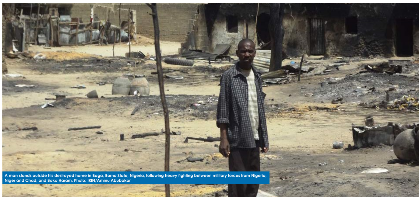
A man stands outside his destroyed home in Baga, Borno State, Nigeria, following heavy fighting between military forces from Nigeria, Niger and Chad, and Boko Haram.